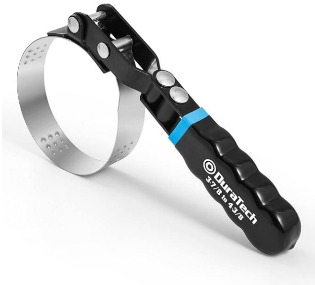
Figure 2. Oil filter wrench: the right tool makes any job easier.

So if you go all the way to the top, in your left upper hand side of the whole page, let me show you what I'm doing here. Let me go to a different screen. Hold on a minute, okay, here now.